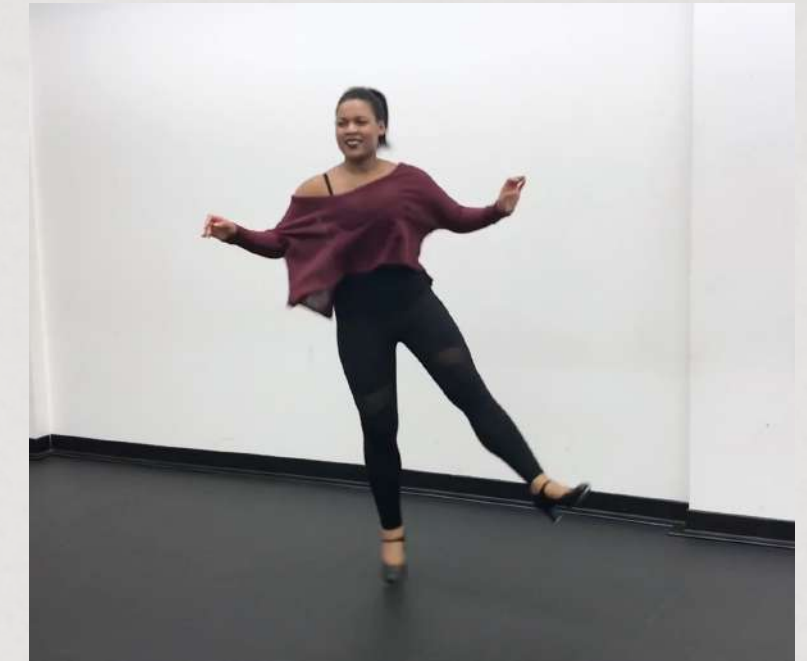
TAP DANCE DEMONSTRATION