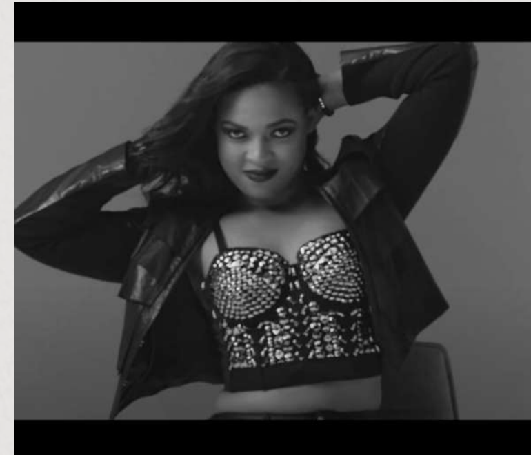
"SHADE": MUSIC VIDEO