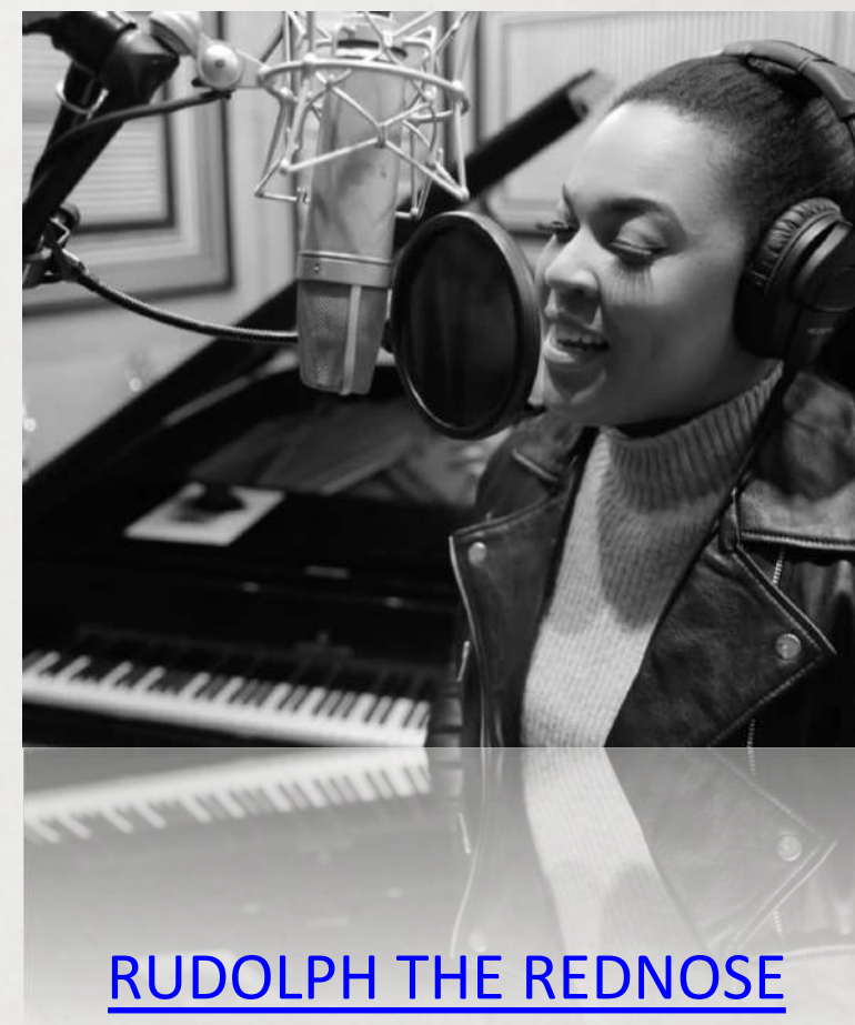
RUDOLPH THE REDNOSE REINDEER